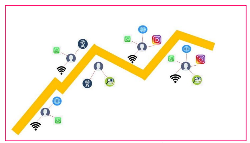
Figure: 1.1 Internet Inequity

Many of the institutions like top research centre take the initiatives to rectify the internet inequity. In the internet inequity desperate the people in the technology retrieval of data. Most of the online resources regarding in the Tamil language may give more complex. Even the researcher may have more interest to get the truthful information in their own language but for the Tamil language sites doesn't give much impact. Accessible on the information among the internet is meant inequality due to the digital divide. Technological impact is also one of the reasons for the internet inequity among people[3]. The disparity in the internet sources in the regional language is reduced due to the less research interest on the languages and arts. The divide is taken in the technology and the sources of the information. The sources are very less in the regional language and also the network is also less for the regional language research based on the equal internet.